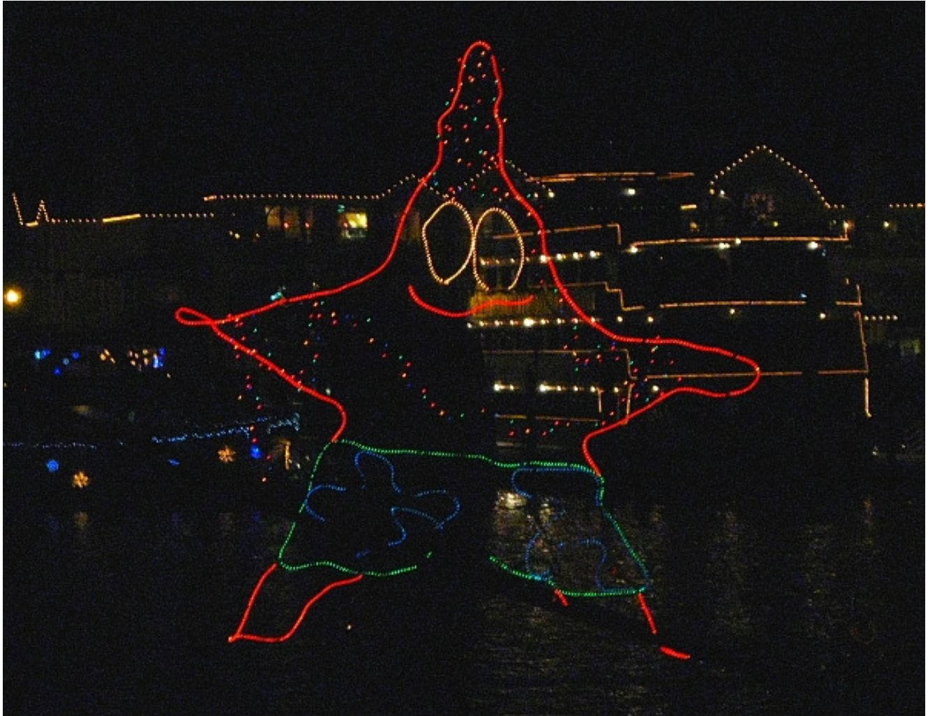
To Spongebob Squarepants.