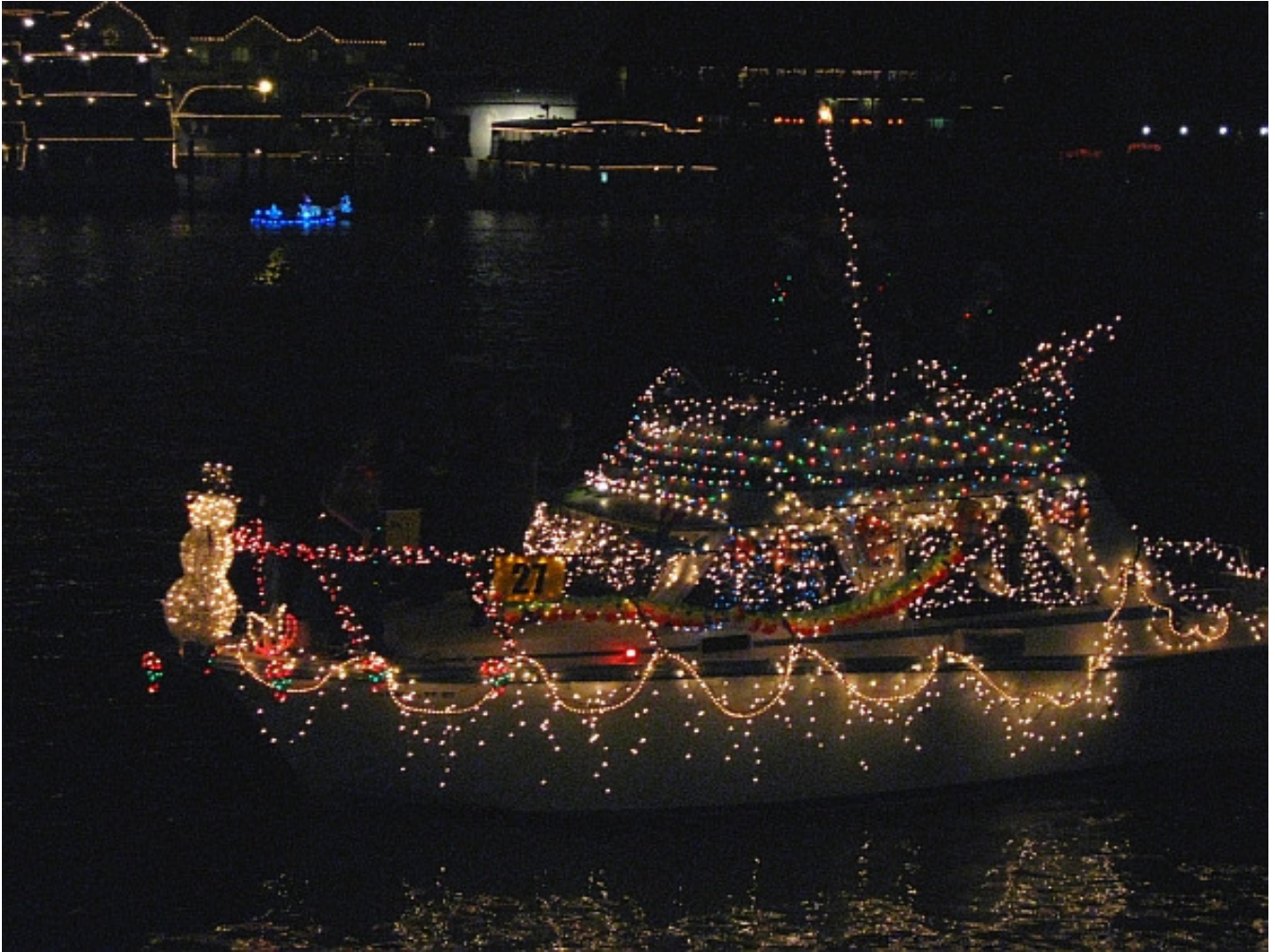
Even a few people-powered rowers appeared in the parade.